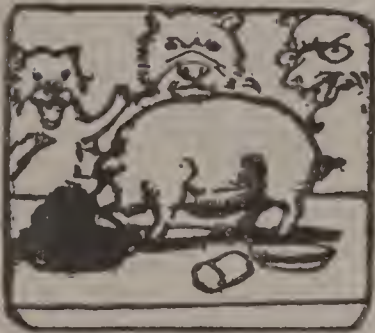
The Pig Would Climb on the Table.

“OH, daddy, won’t you please tell us a story about yourself when you were a little boy?” asked Jack.